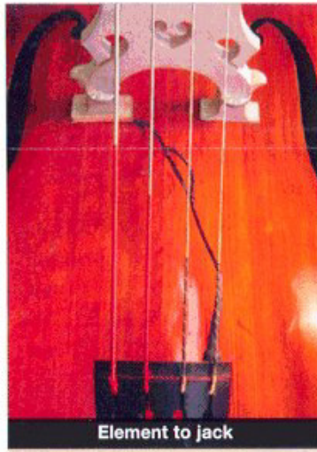
Element to jack

Loosen the bottom 2 strings (the E & A) and slide them off the bridge. Loosen the 1st (G) or top string 2 turns and the 2nd (D string) 3 full turns. Now the tension on the bridge is low enough to slightly raise the bridge foot with one hand to slide the element under with the other hand. (as in photo B). The element should be centered under the bass foot with the wire extending from the lower inside corner.